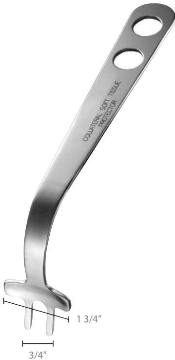
COLLATERAL SOFT TISSUE RETRACTOR OM 82-0060 9 1/8" (232mm) length