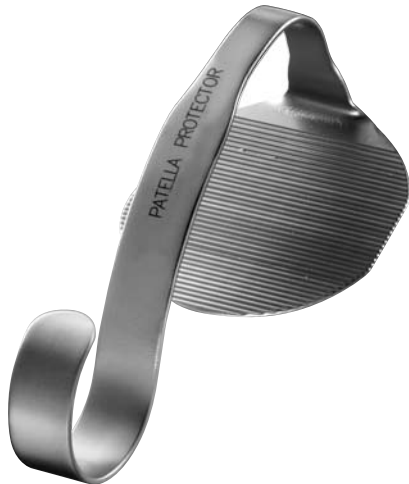
RESECTED PATELLA PROTECTOR OM 82-0075 3 1/2" (83mm) length