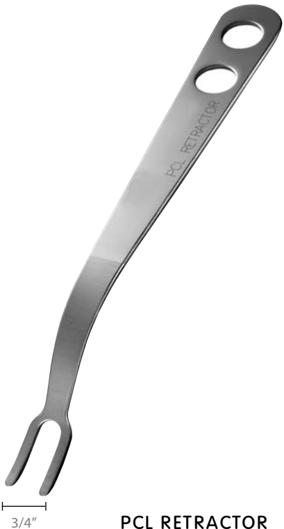
PCL RETRACTOR OM 82-0055 10 1/2" (267mm) length